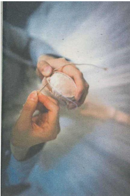
Figure 2: Yan Zhang from the Beijing Dance Academy mends a pair of ballet shoes during rehearsals for The Nutcracker on Sunday